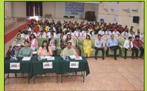
The attentive judges...