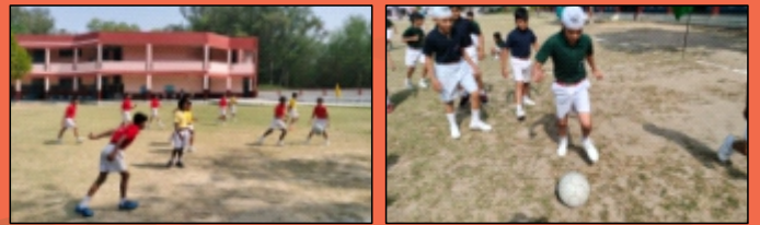
The matches in progress....