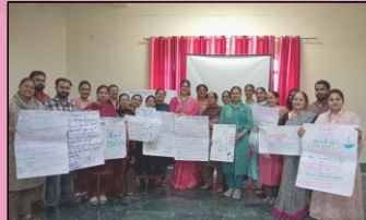
The participants sharing their assignments