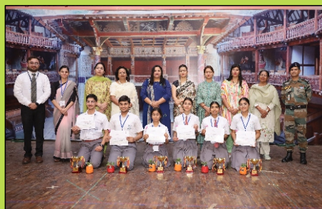
APS Beas, Second Runner Up 11 Corps Inter APS's Ethic Bowl Contest 2023