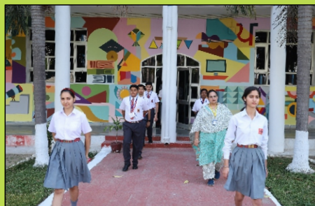
Contestants on their way to the venue...