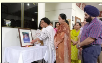
26 April 2023: The Principal and Staff paying their respects