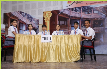
Team F - APS Kapurthala