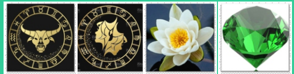
TAURUS GEMINI LILY OF THE VALLEY EMERALD

The fifth month of the year in the Julian and Gregorian calendars, May has 31 days. It is named after the Greek Goddess Maia. According to Roman belief, May is named for the 'majores', ie elders (senior citizens). It signifies the onset of summers in the northern hemisphere and winter in the southern hemisphere.