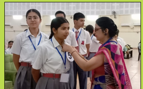
...Receiving their identification tags