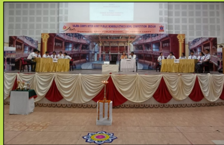
The teams in action...