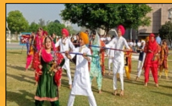
Folk Dances of Punjab being presented by class VIII H