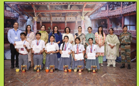
APS Tibri, Winner 11 Corps Inter APS's Ethic Bowl Contest 2023