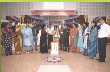
Lighting of the ceremonial lamp