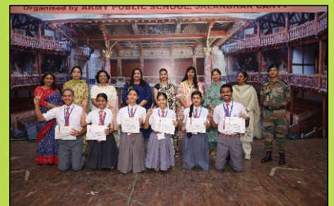
Team Vajra ... 11 Corps Representatives for Western Command Ethic Bowl Contest