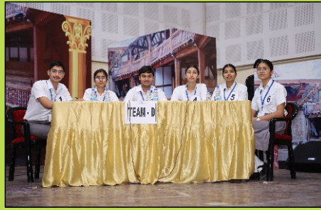
Contesting Teams... Team D - APS Beas