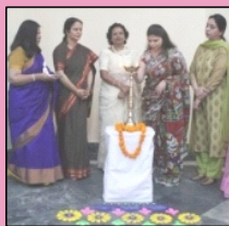
Lighting of the ceremonial lamp