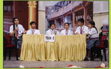
Team E - APS Tibri