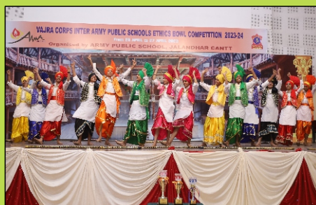
A Colourful Finale...