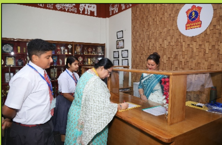
Welcome and registration