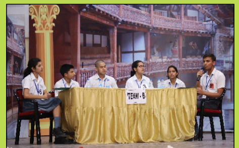
Team B - APS Jalandhar