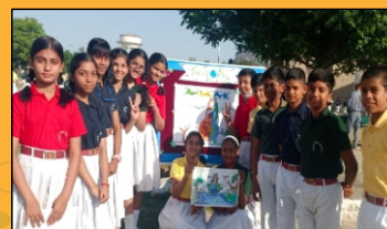
Class VII H posing with their posters