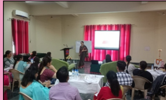
The workshop underway...