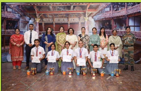
APS Jalandhar, Runner Up 11 Corps Inter APS's Ethic Bowl Contest 2023