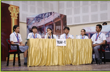
Team C - APS Amritsar