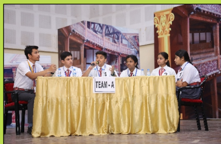
Team A - APS Firozpur