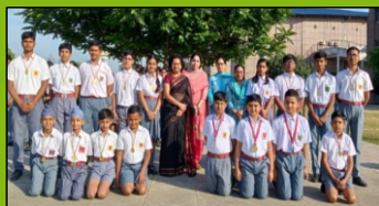
The proud winners posing with the Principal and Vice Principal