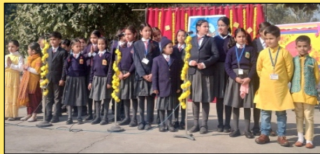
He Sharde Maa...The Junior School Choir