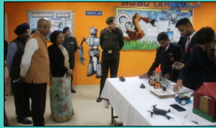
The guests visit the school's Robotic Lab...