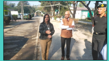
MD AWES and Chairman APS with the HM in the Junior Wing