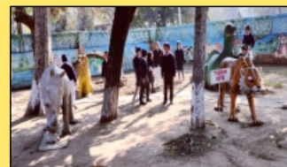
Animal Safari time ...