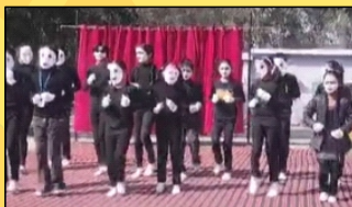
Sarojini Naidu House: Save Farmers