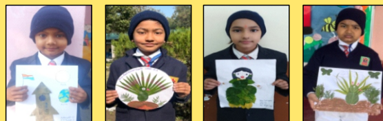
Adhinath VS I C