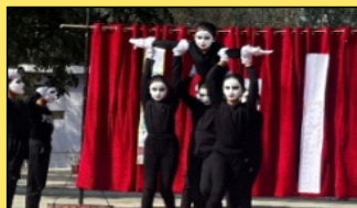
Laxmibai House: Women Empowerment