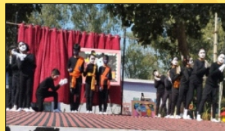
Subhash C Bose House: Respect Women