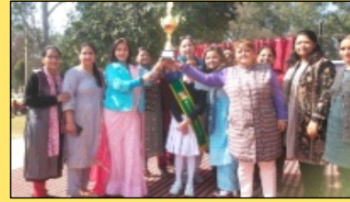
Winner: Co Curricular Activities Trophy 2023-24 Bhagat Singh House