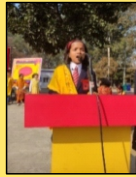
Aahana IV C