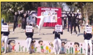
Bhagat Singh House – Our Dream: Make Ganga Clean