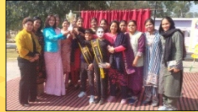
Winner: Sports Trophy 2023-24 Laxmibai House