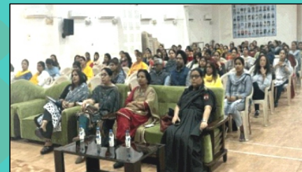
The attentive audience