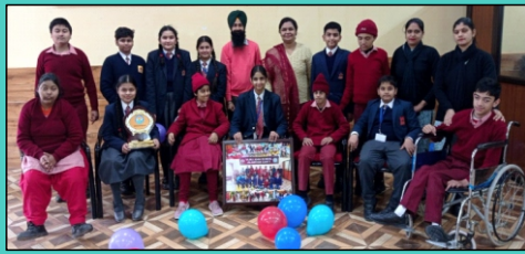
Children from APS and Asha School posing with their mentors

APS JALANDHAR STUDENTS VISIT ASHA SCHOOL, JALANDHAR 01 MARCH 2024