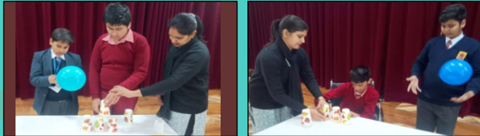
'Saath Saath' buddy activities in progress