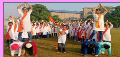
We are one... Cultural Presentation by class VII