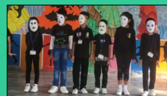
Mine Presentation by class II on 'Excessive use of mobile phones'