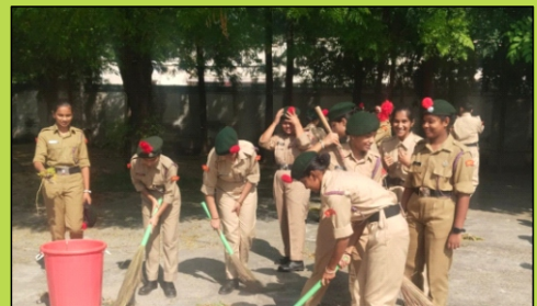
NCC cadets busy at work...