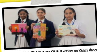
EK BHARAT SHRESHTHA BHARAT CLUB: Paintings on 'Odishi dance'