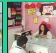
Happines Zone, a place for children to share their thoughts..