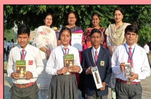
The winners posing with their mentors