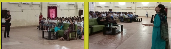
The experts counselling the students...

IN ATTENDANCE: Class XI - XII students from APS and KV 1-4, Jalandhar