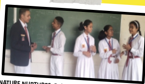
NATURE NURTURES: Role Play: Understanding the Importance of wildlife