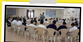
ART CONNOISSEURS: Learning the techniques of Acrylic Color painting