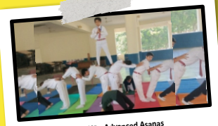
RHYTHMIC YOGIS CLUB: Advanced Asanas