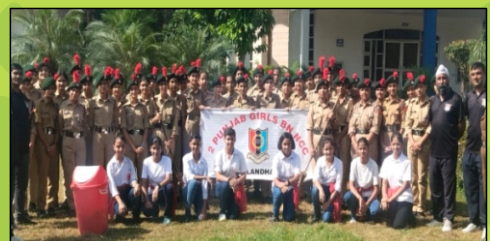
The participants posing with their instructors