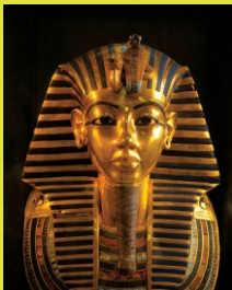
Tutankhamen's Burial Mask

Pharaoh was the name ancient Egyptian kings were known by. Tutankhamen was one of the youngest known pharaohs of Egypt. He ruled from the age of 9 years to around 19 years, when he died a very mysterious death. At the time of burial, a pharaoh's face was covered with a golden mask resembling his facial features, with the belief, that on his entry into the world beyond death, he would be easily recognised. Tutankhamen's tomb in Egypt's 'Valley of Kings', was discovered by a British archeologist in 1922.