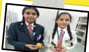
D.E.A.R CLUB: Remembering Netaji Subhash C Bose