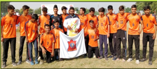
Team JAPS with their Trophy