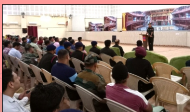
The Chairman addressing the parents

IN ATTENDANCE: Parents of children from class I -XII