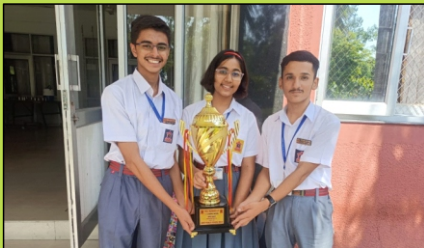
Our Quizzers with their Reward