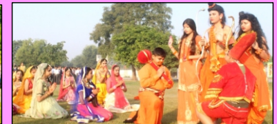
Ramlila Presentation by Class I B,C and class VII H