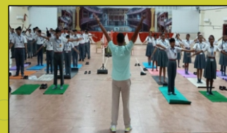
Children enjoying Mind Games, Zumba and Yoga therapy...