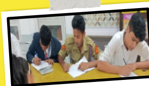
SOCIAL DEVELOPMENT CLUB: Learning Household Budget preparation