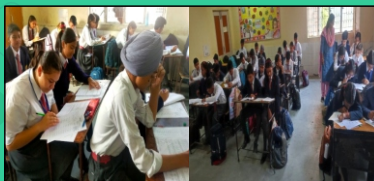
Olympiad in progress

LOGIQDS MENTAL APTITUDE OLYMPIAD, CLASS I - IX: 29 OCTOBER 2023