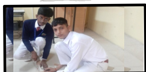
ROBOTICS CLUB: Project AI in progress