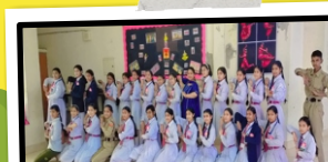
NATRAJ CLUB: Dancing on 'Ghar mohe pardesia'