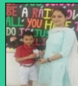
Thank you teacher... Gratitude card presentation

WORLD MENTAL HEALTH WEEK CELEBRATION: 4- 11 OCTOBER'23