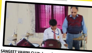
SANGEET VAHINI CLUB: Learning basic beats on drums