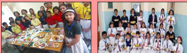
Children showing dishes created by them