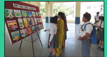
Visitors admiring the children's creations

SPECIAL ASSEMBLIES HELD DURING THE MONTH