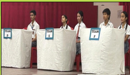
Team D is Team JAPS