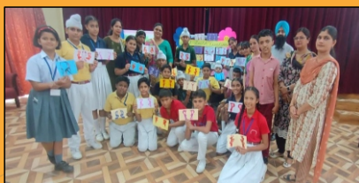
Children Showing thread paintings created through the 'Saath Saath Buddy' collaborative exercise, pairing up with differently abled children