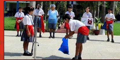
Class V D showing ' Say No to Plastic'