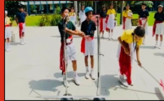
Class VC presenting a scene on 'Dignity of Labour'

To make children aware of social issues requiring attention, a fun filled exercise has been introduced in our school. Children from different classes prepare and present street plays on allotted topics, turn wise everyday, during the recess. Here is a glimpse of some of the issues depicted by the children this month.