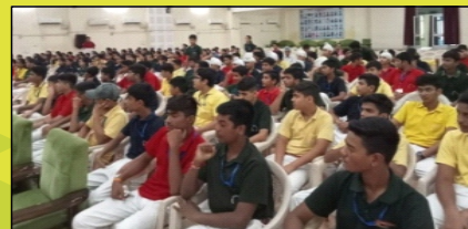
The audience listening carefully