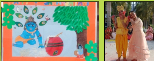
Greetings from Class VI E