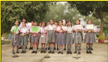
हिन्दी कविता गायन कक्षा 3 & 4