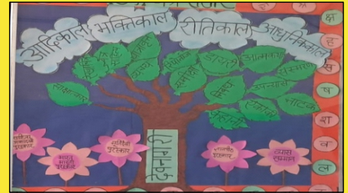
विद्यार्थियों द्वारा प्रदर्शित बुलेटिन बोर्ड