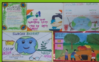
Posters created by children to spread awareness on the subject