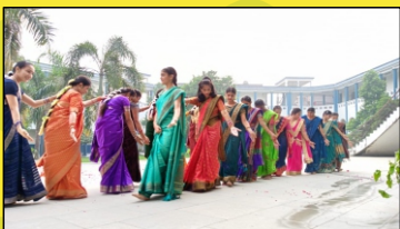
हिन्दी दिवस-मनोरम नृत्य प्रस्तुति कक्षा - 8