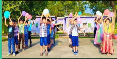
Tiny tots entertaining their mentors