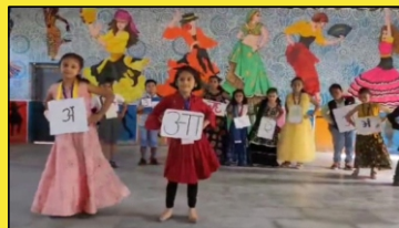
हिन्दी भाषा ज्ञान-एक संगीतमय प्रस्तुति कक्षा 1 & 2