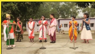
एकांकी कक्षा 3 & 4