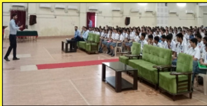
The session in progress