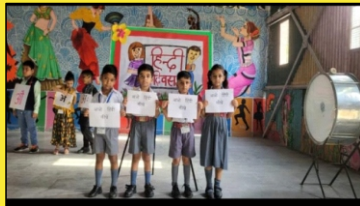
हिन्दी नारा अनुवाचन कक्षा 1 & 2