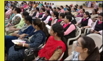
The attentive audience